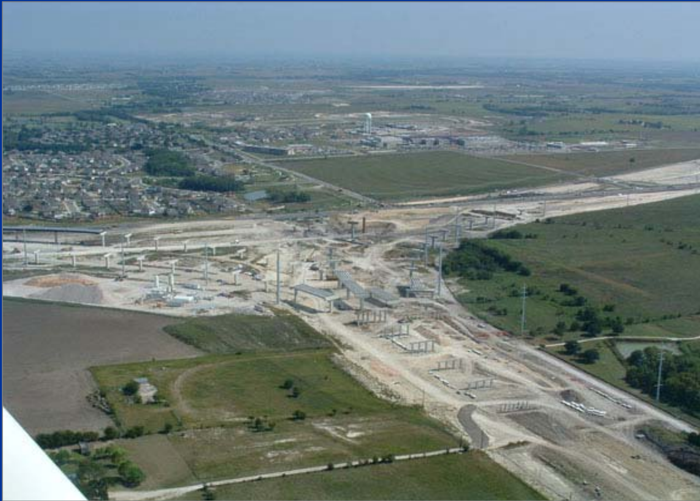
SH 130 at SH 45N Interchange looking east