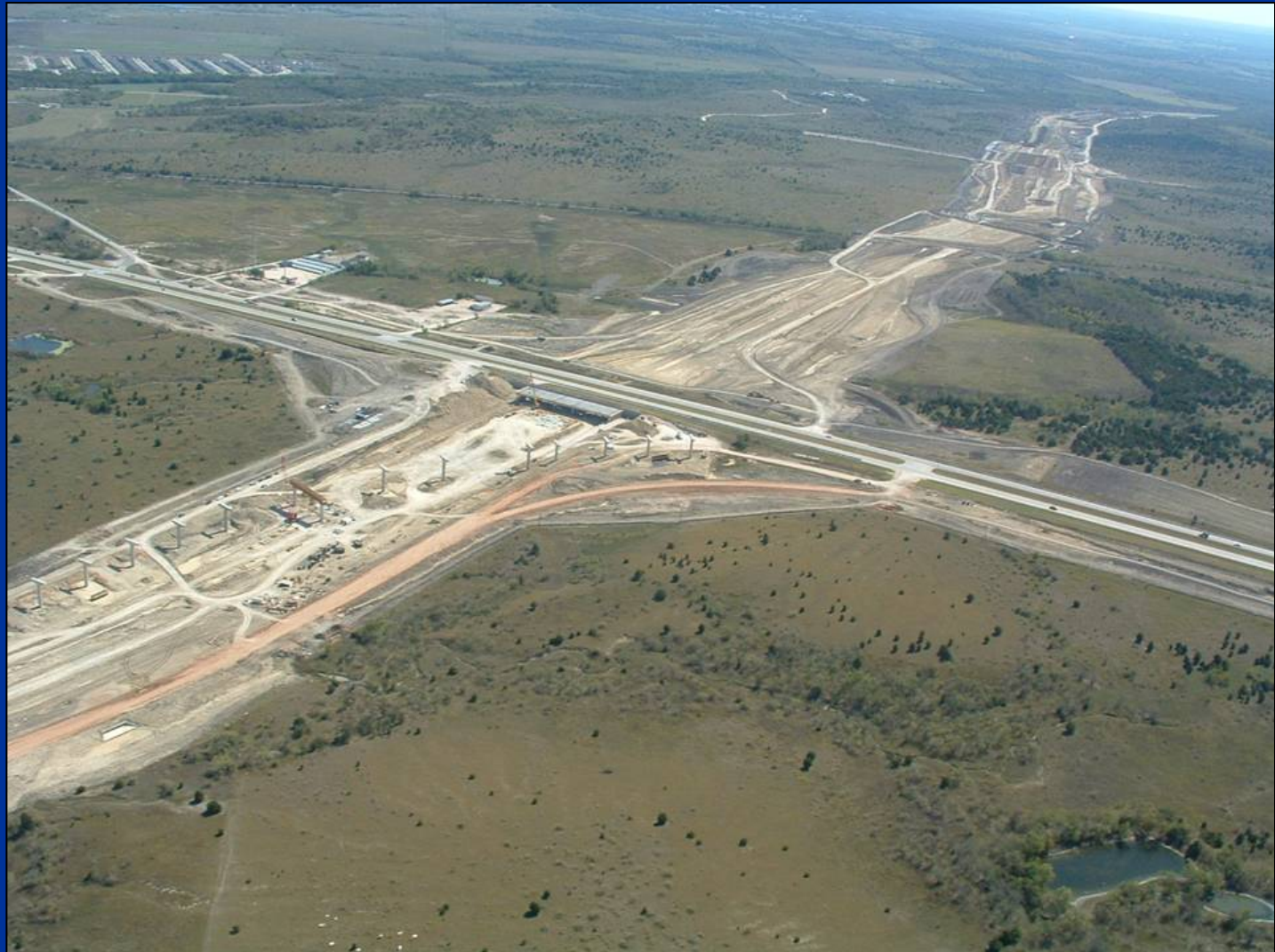
SH 130 at US 290 looking south