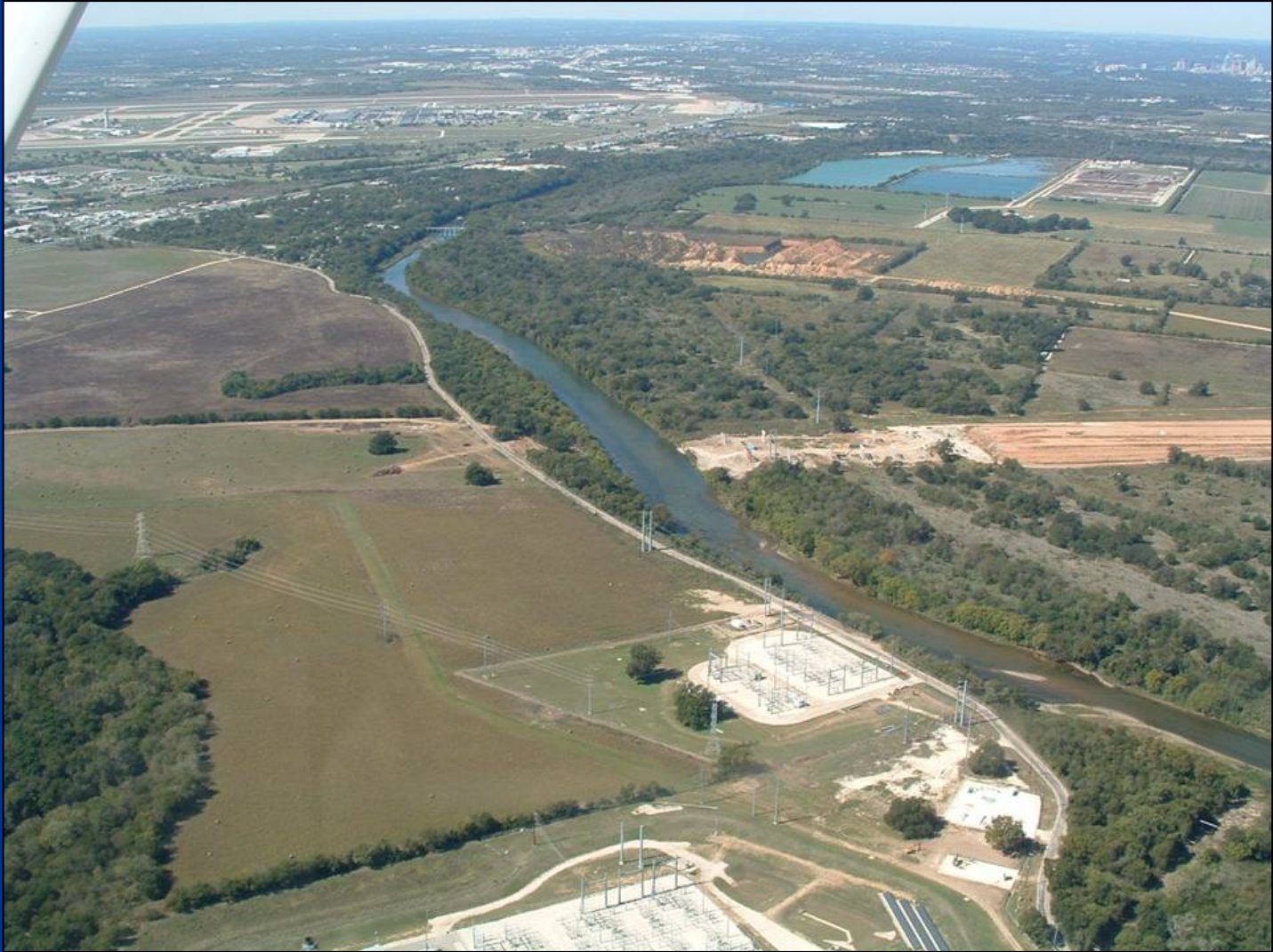
SH 130 at Colorado River